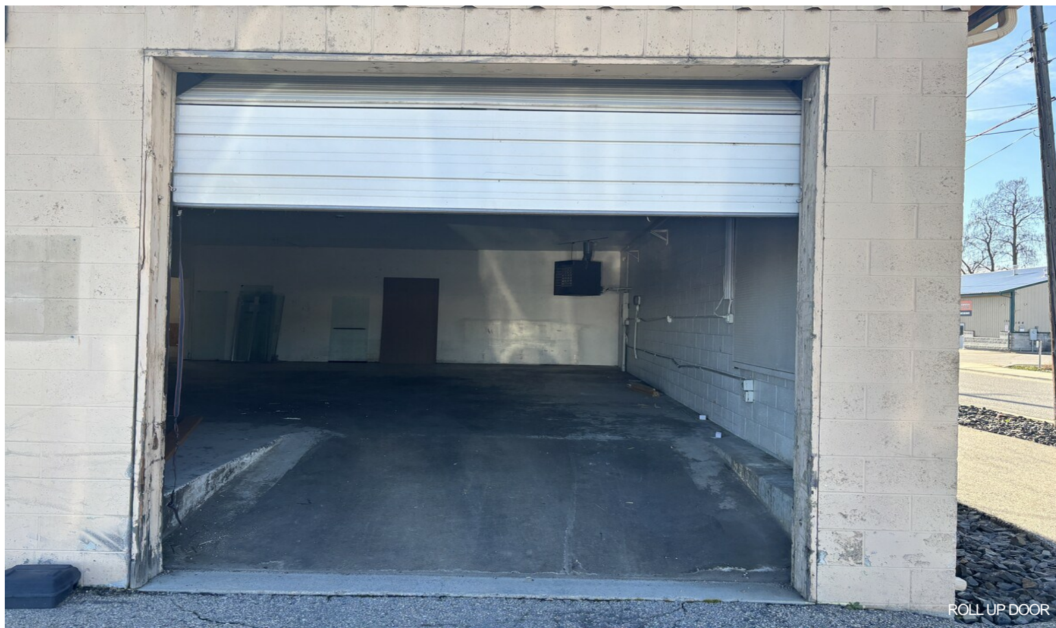
ROLL UP DOOR