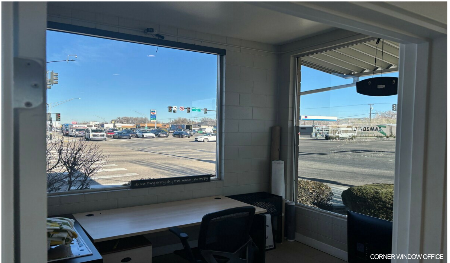
CORNER WINDOW OFFICE