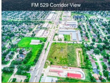
FM 529 Corridor View