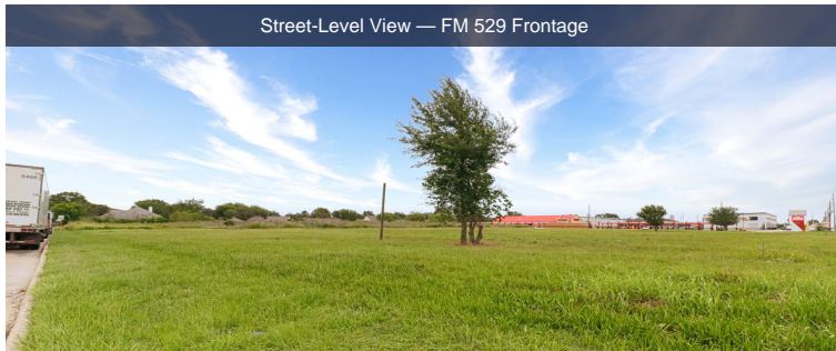
Street-Level View — FM 529 Frontage

Nearest Highway: Beltway 8 (~4.5 mi east)