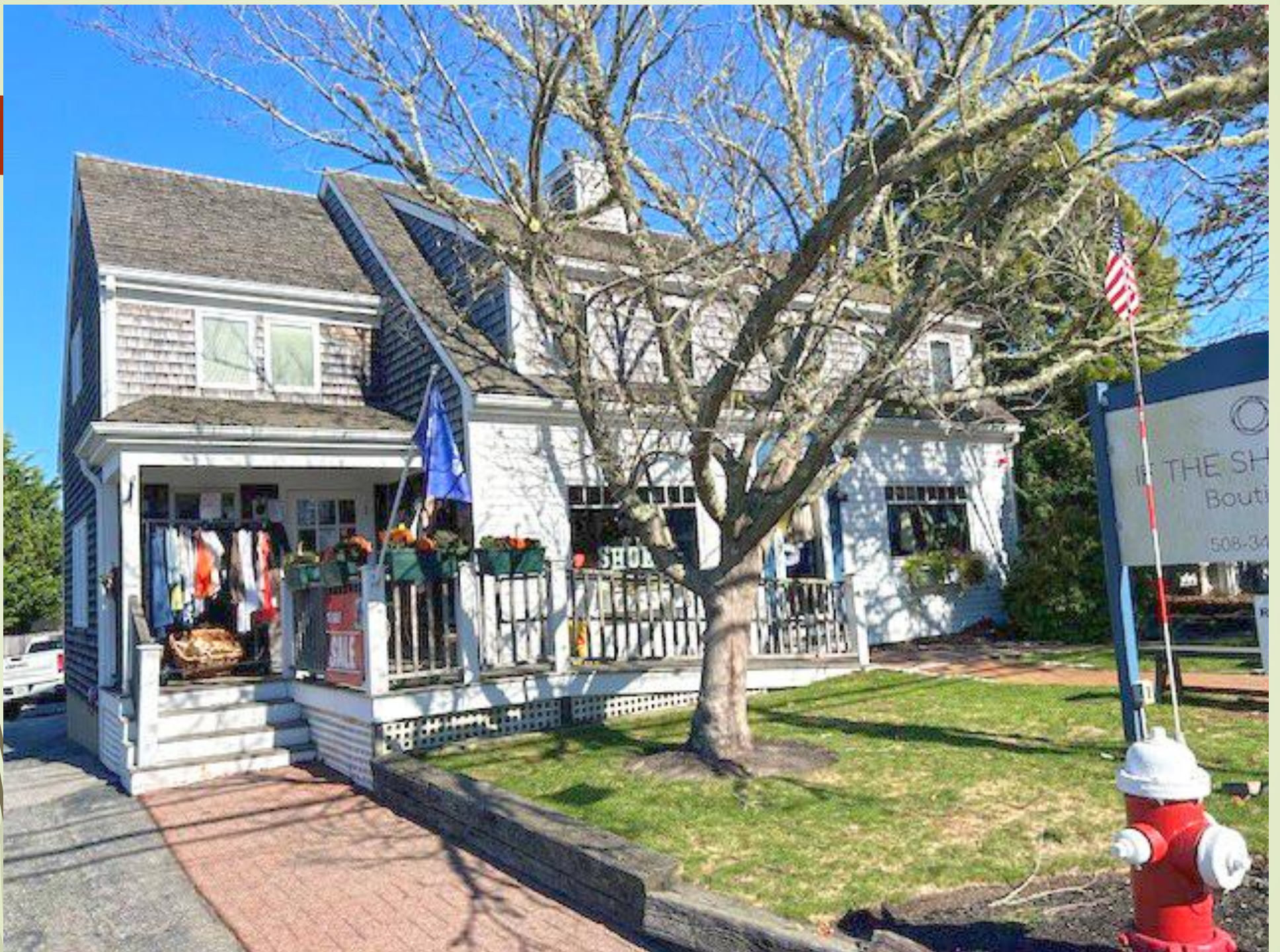
442 Main Street - Chatham, MA