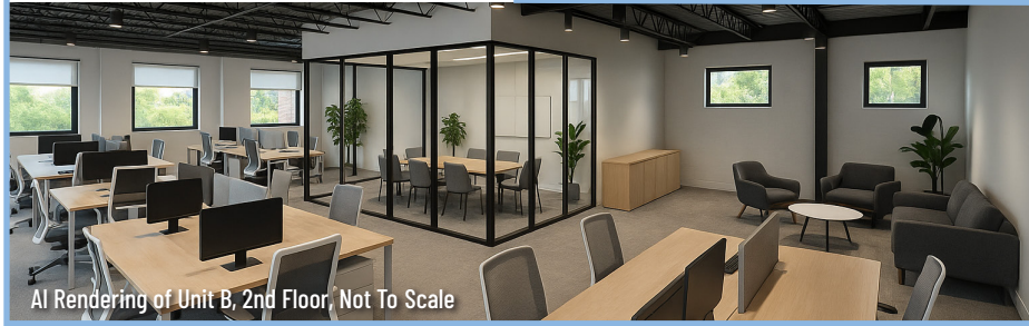
AI Rendering of Unit B, 2nd Floor, Not To Scale