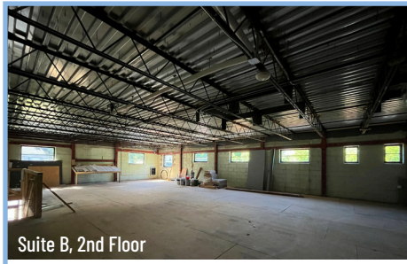
Suite B, 2nd Floor