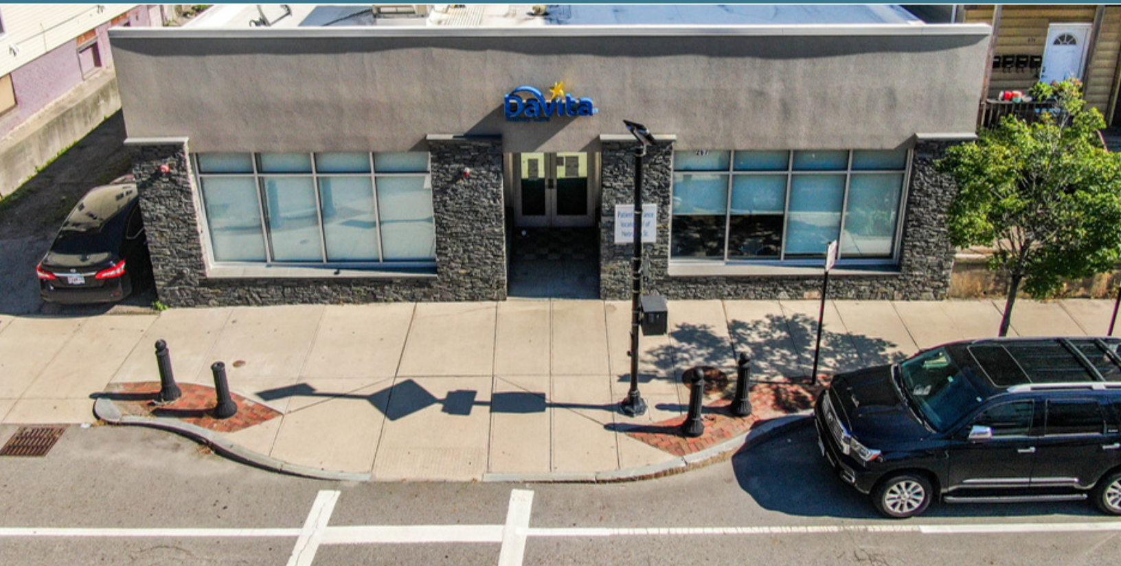
Shrewsbury Street facing façade