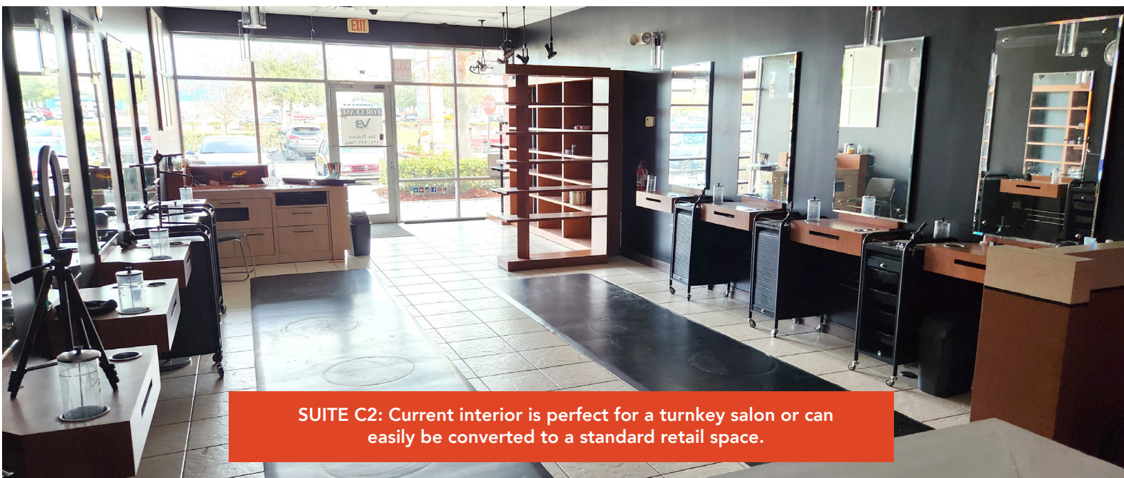
SUITE C2: Current interior is perfect for a turnkey salon or can easily be converted to a standard retail space.