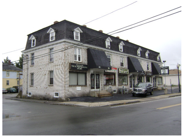
( https://images.vgsi.com/photos/WarwickRIPhotos//00\04\75\81.JPG )