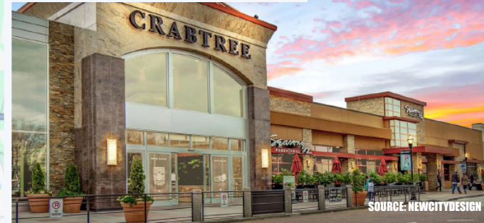
CRABTREE VALLEY MALL | 10 MINS