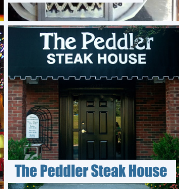
The Peddler Steak House