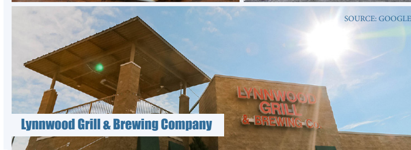
Lynnwood Grill & Brewing Company