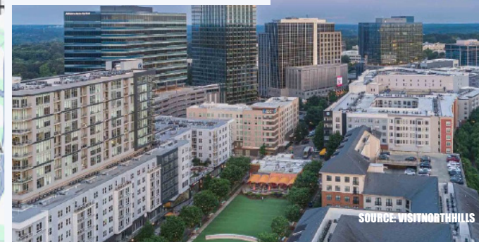
NORTH HILLS | 16 MINS