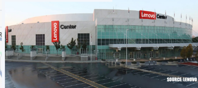
LENOVO CENTER | 10 MINS