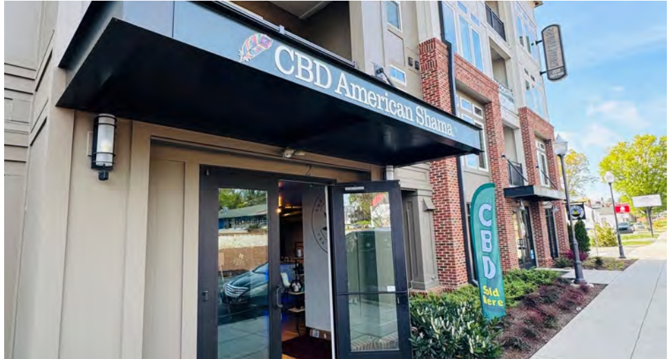
RETAIL SPACE AVAILABLE IN STATION TWO22 (82-UNIT APARTMENT COMPLEX)