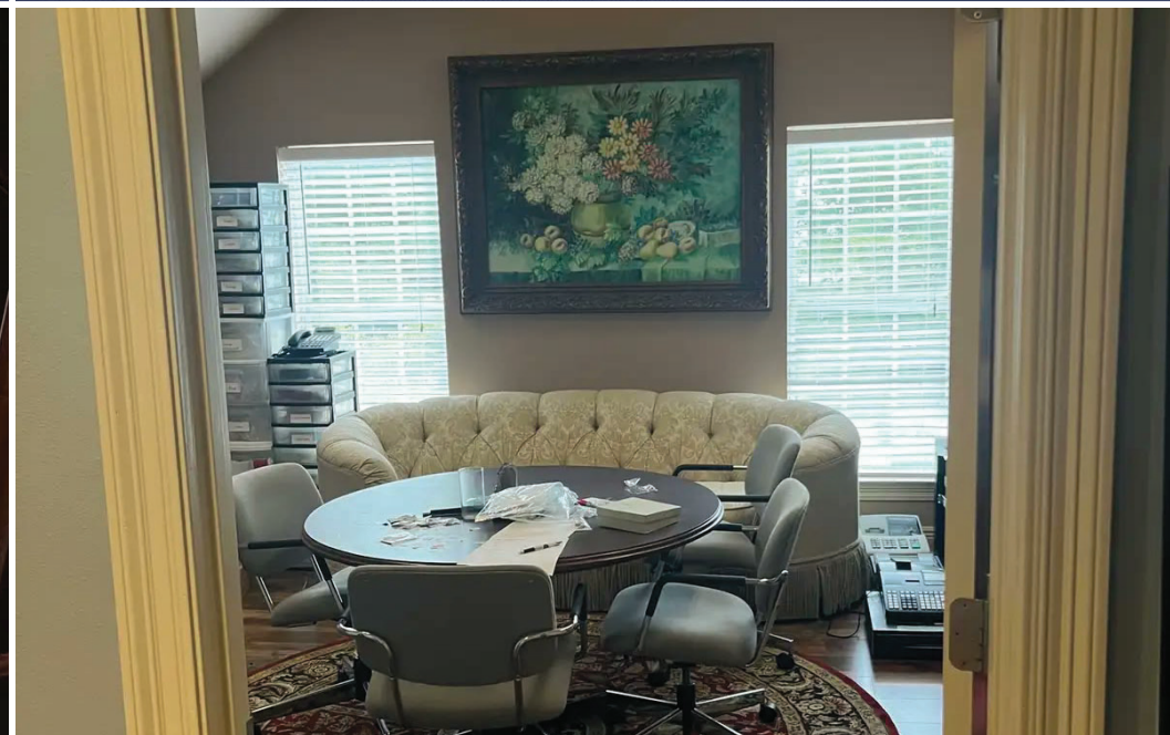
CONFERENCE / BULLPEN AREA