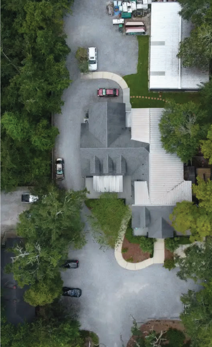
DOWNTOWN COVINGTON OFFICE PROPERTY