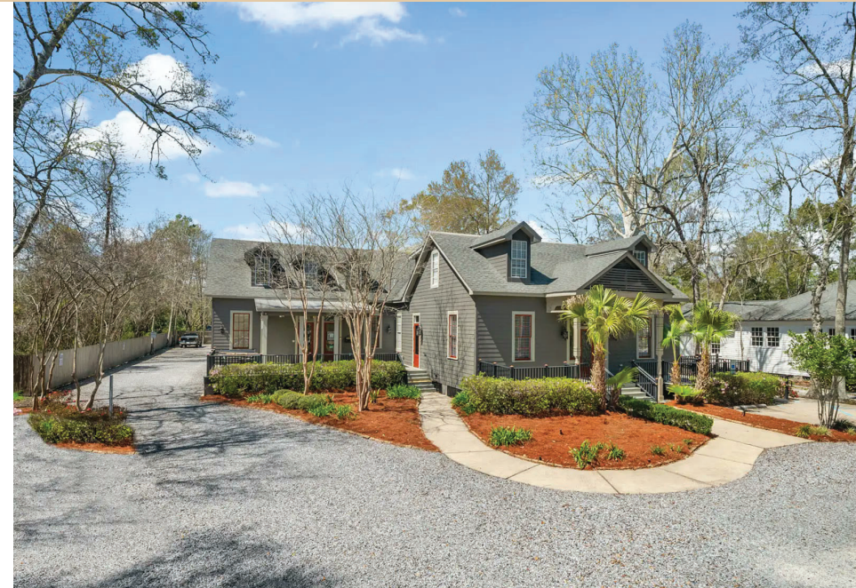
DOWNTOWN COVINGTON OFFICE EXTERIOR