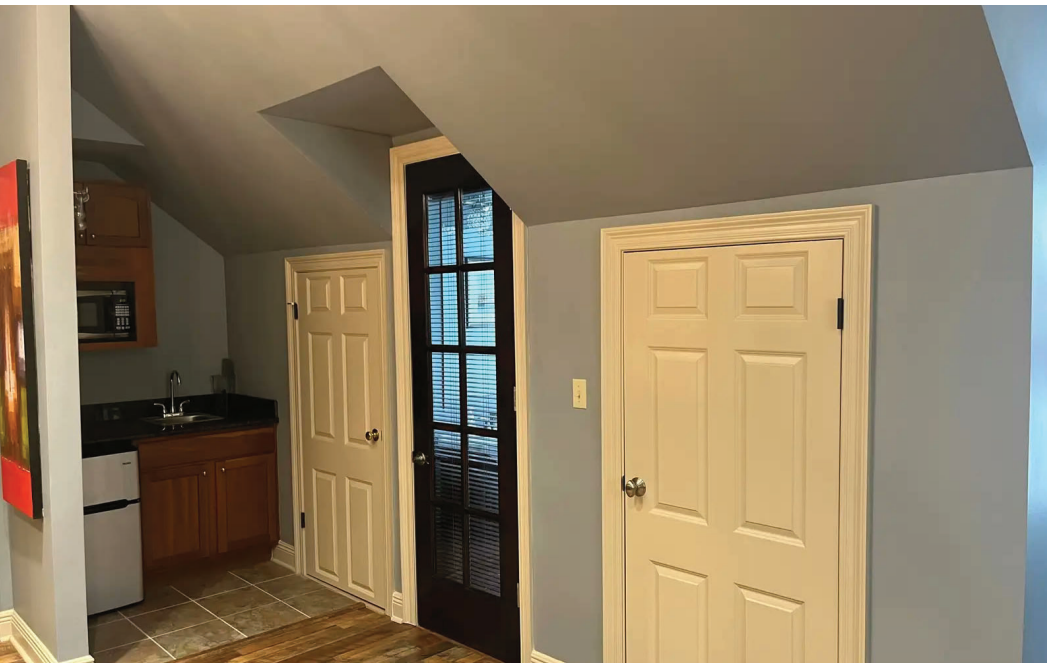
OPEN OFFICE INTERIOR