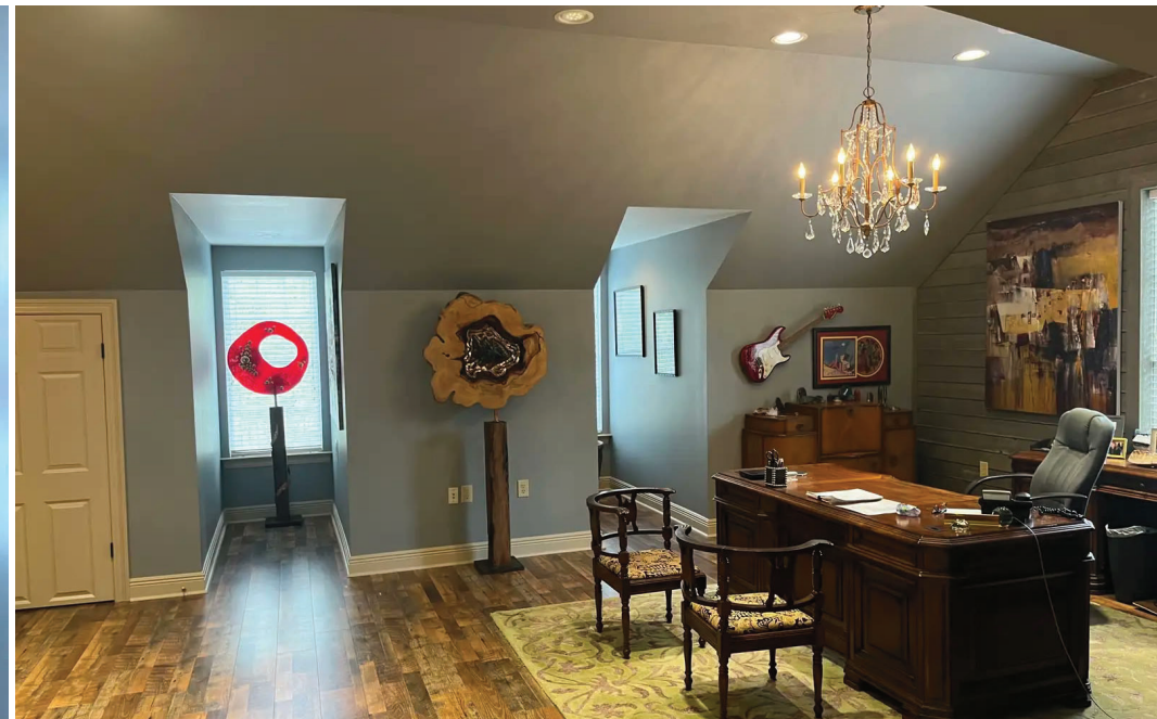
EXECUTIVE OFFICE DETAIL