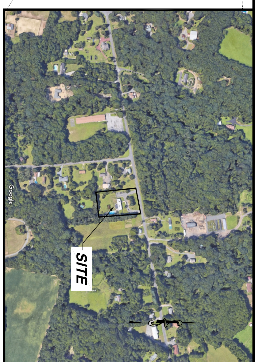
LOCATION MAP SCALE: (1 inch = 500 Feet) 0 500 1000 1500