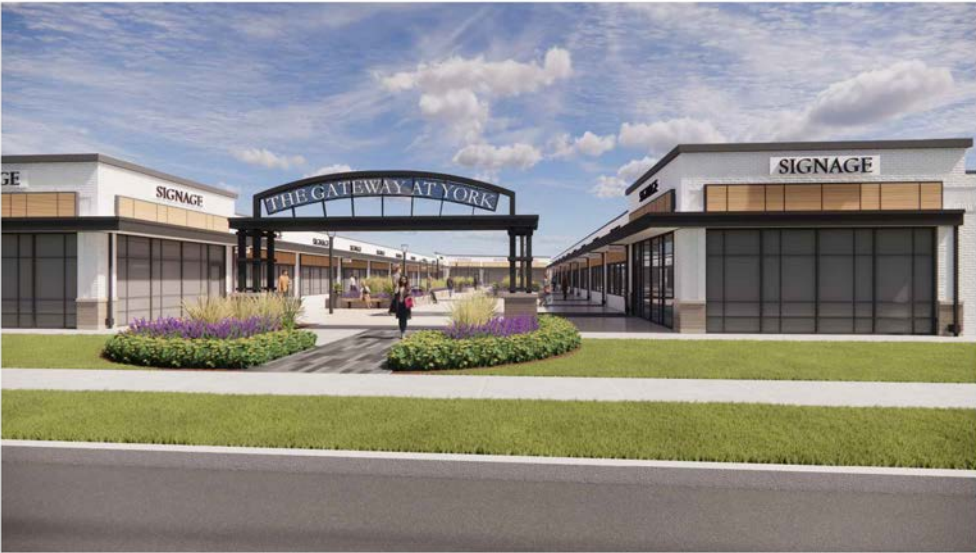
COURTYARD FROM YORK ROAD