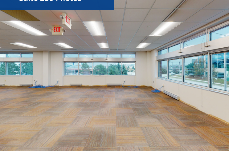
Suite 230 Photos