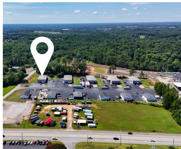
GREENVILLE COUNTY TAX MAP NO M013020100900