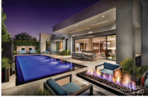
Azure Scottsdale Luxury Homes