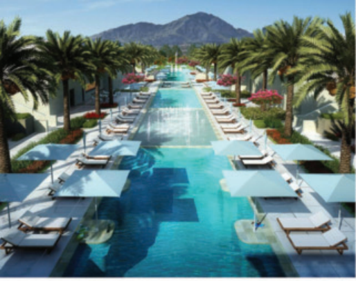
Ritz Carlton Paradise Valley