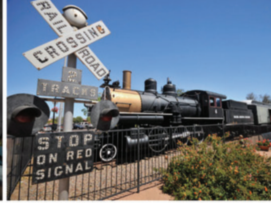
McCormick-Stillman Railroad Park