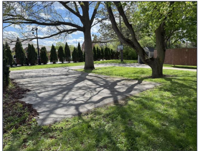
Rear paved parking lot