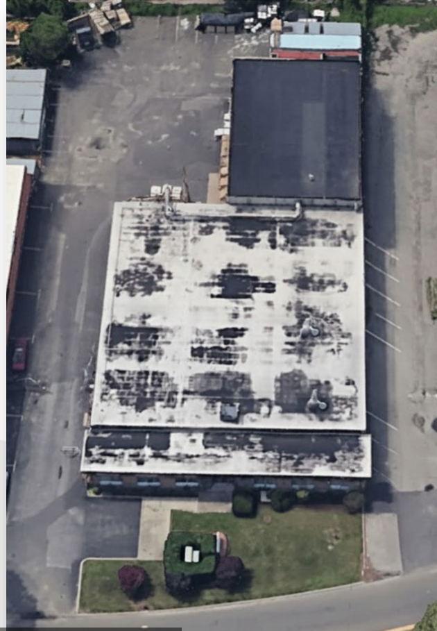
Photo Digitally Enhanced to Remove Cars

For Information Contact Exclusive Broker: