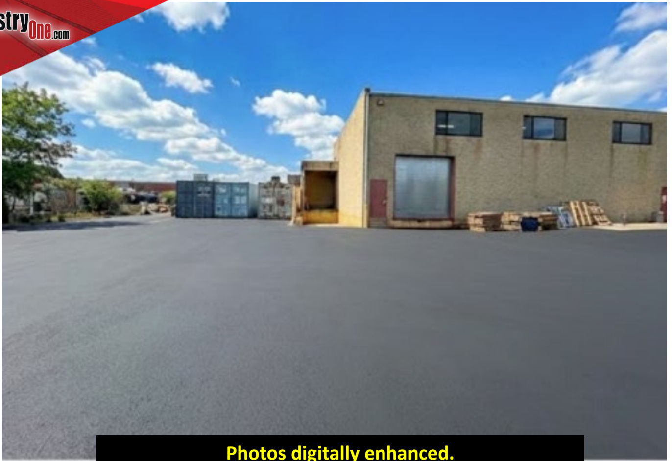
Photos digitally enhanced. Pavement imperfections removed for visualization.