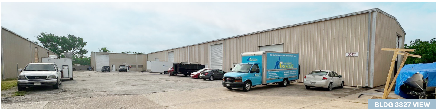
BLDG 3327 VIEW

5847 San Felipe Street, Suite 1400 | Houston, TX 77057 713.629.0500 | partnersrealestate.com