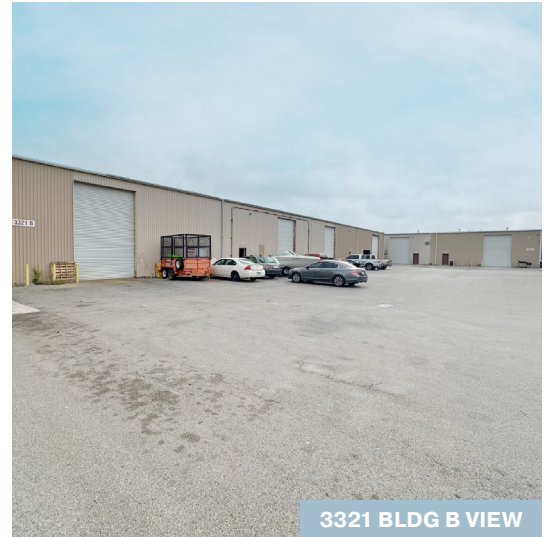
3321 BLDG B VIEW