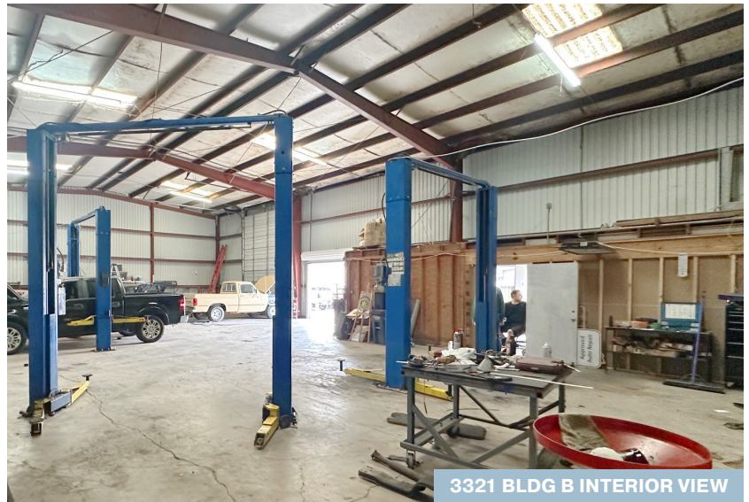
3321 BLDG B INTERIOR VIEW