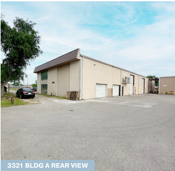
3321 BLDG A REAR VIEW