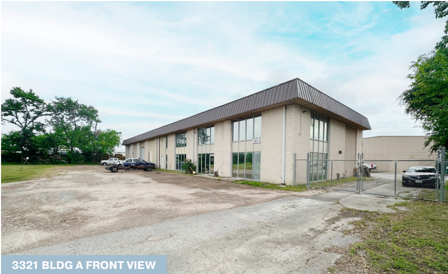
3321 BLDG A FRONT VIEW

3321, 3325 & 3411 Westside Drive & 0 Vista Road | Pasadena, TX 77504