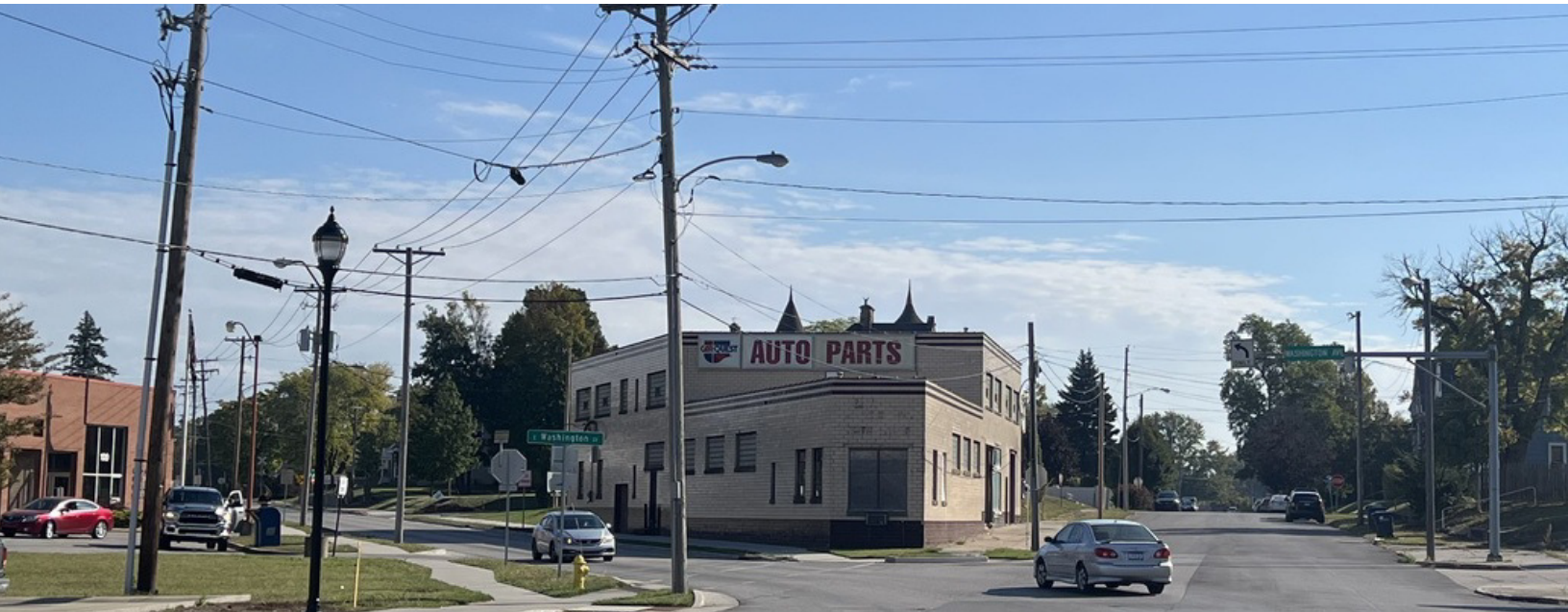
Located close to Downtown Frankfort