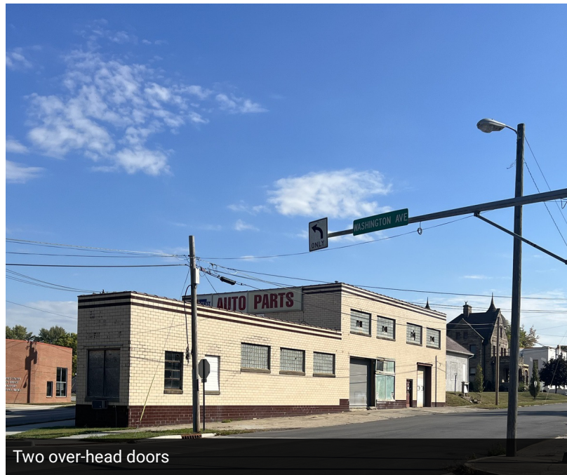
Two over-head doors