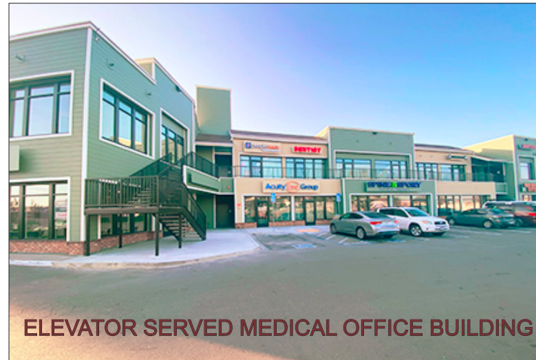
ELEVATOR SERVED MEDICAL OFFICE BUILDING