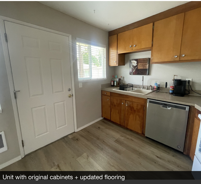
Unit with original cabinets + updated flooring