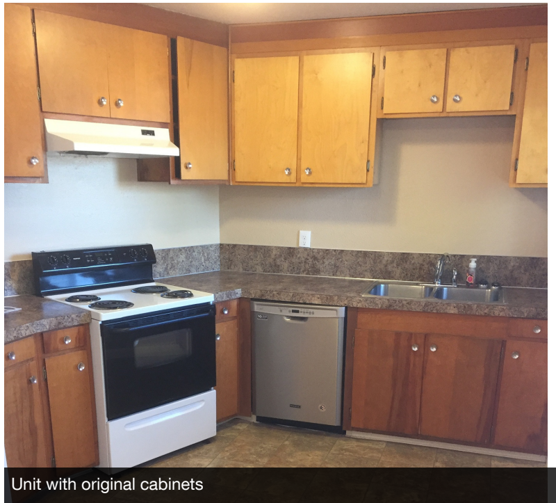
Unit with original cabinets