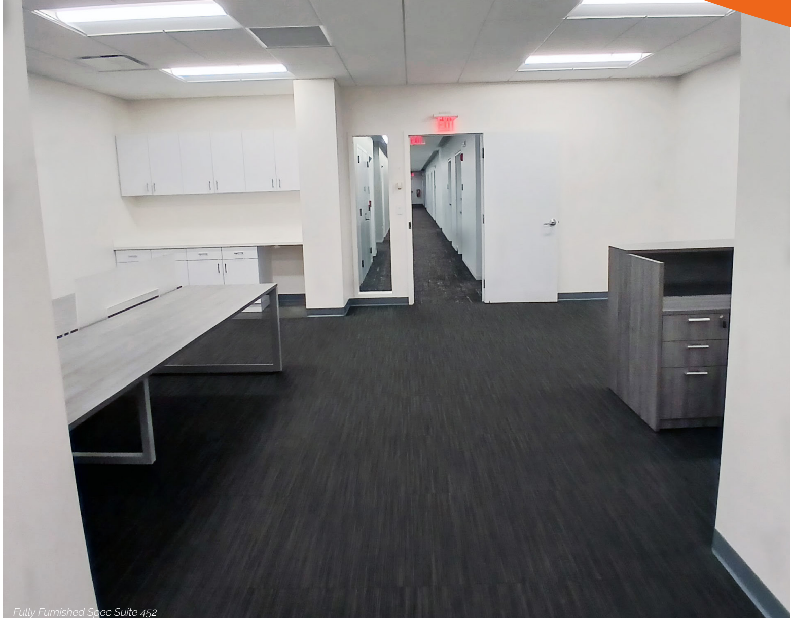
Fully Furnished Spec Suite 452