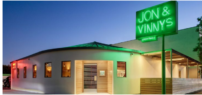
Jon & Vinny's is a local favorite spot offering delicious Italian-American comfort food, including wood-fired pizzas and handmade pastas.