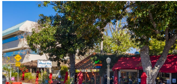
Aroma Cafe. Cozy cafe with breakfast, sandwich, salad, pastry & coffee options plus backyard patio seating.