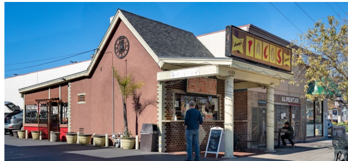
Henry's Tacos. Popular, longtime taco stand offering window service, a simple menu & a few outdoor tables.