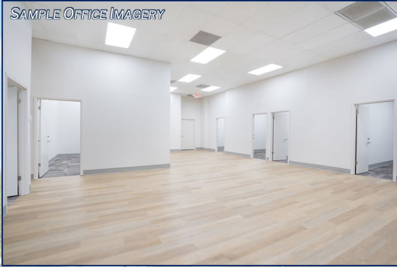
SAMPLE OFFICE IMAGERY