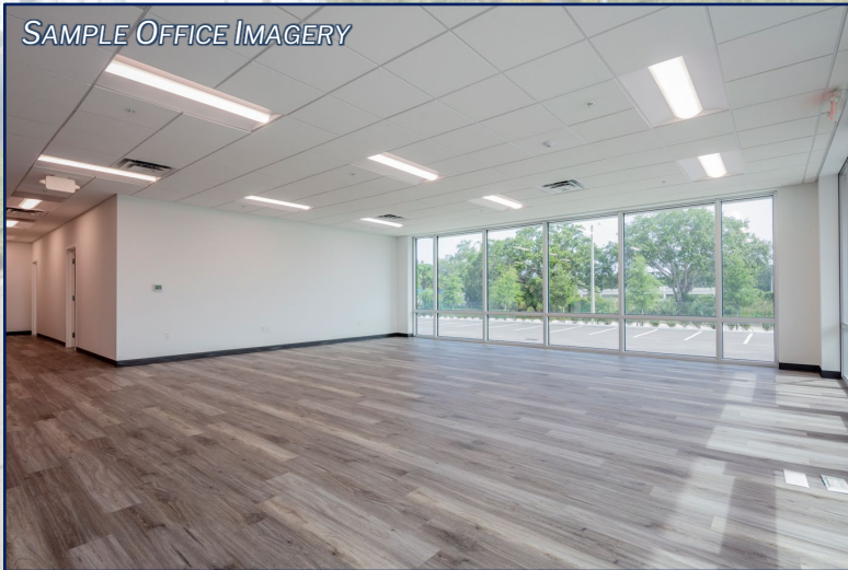
SAMPLE OFFICE IMAGERY