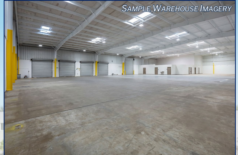
SAMPLE WAREHOUSE IMAGERY