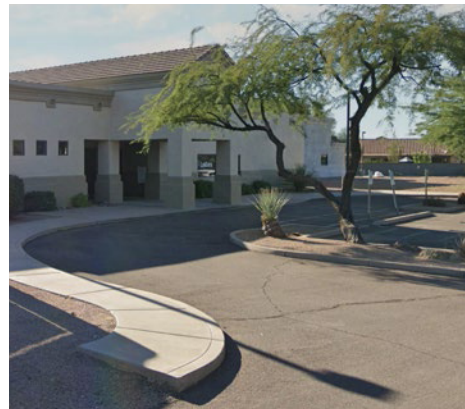
PATIENT DROP-OFF DRIVEWAY

Prominent double sided signage facing S Kings Ranch Rd