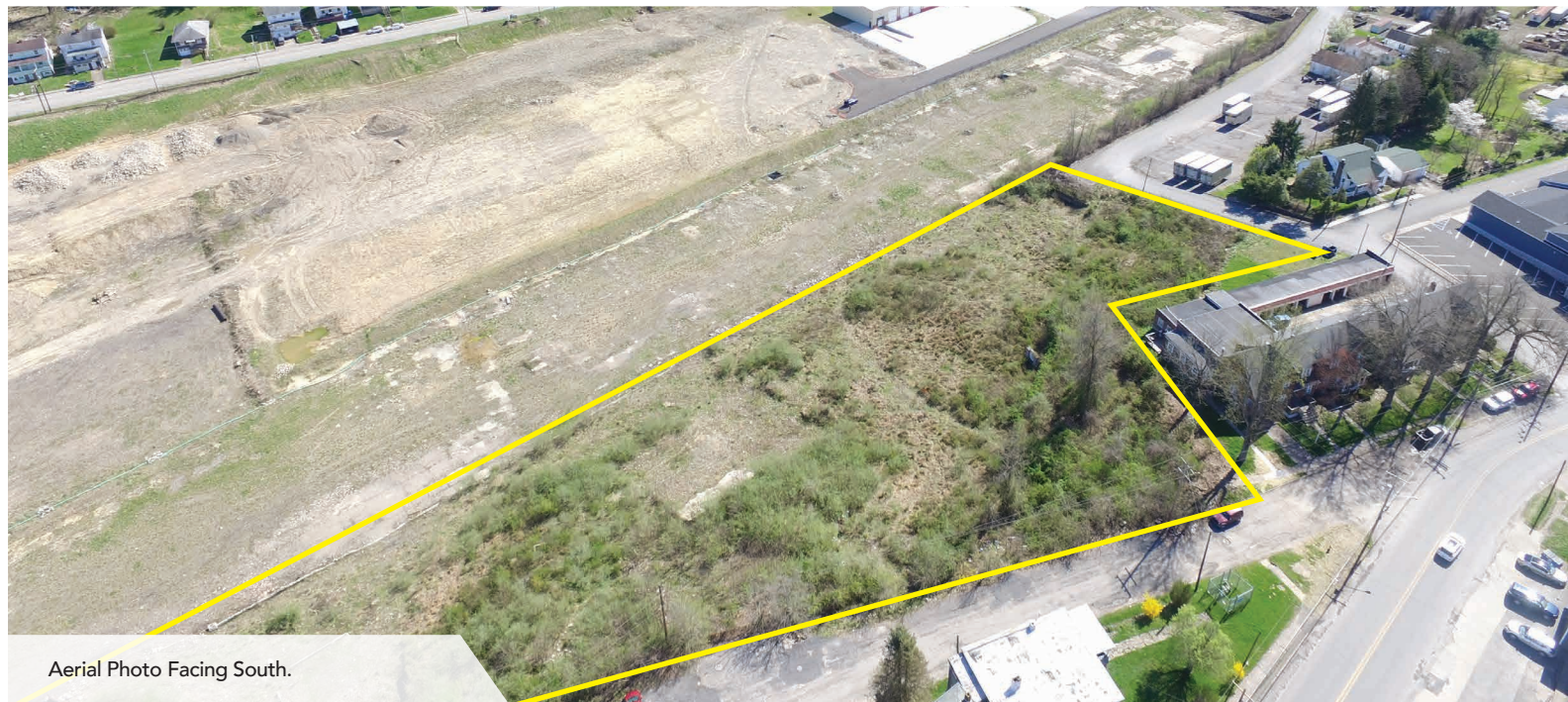
Aerial Photo Facing South.