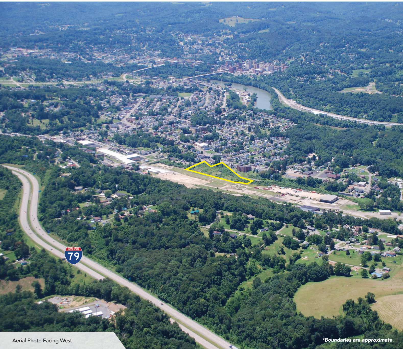
Aerial Photo Facing West.