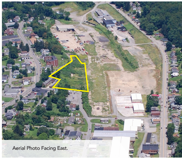
Aerial Photo Facing East.