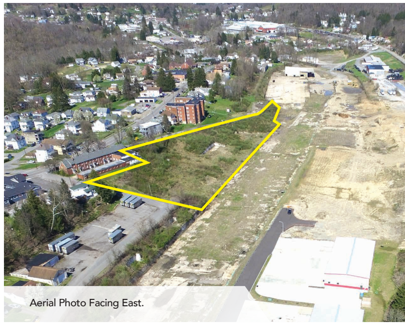
Aerial Photo Facing East.