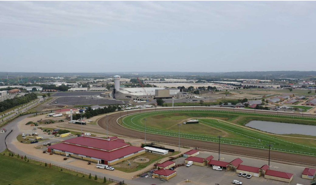
Mystic Lake Amphitheater