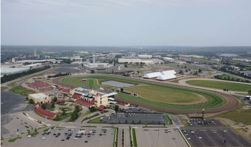
Caterbury Park Racetrack