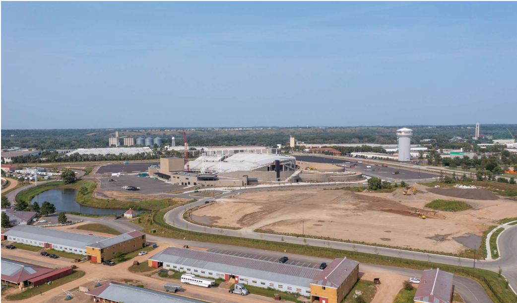
Mystic Lake Amphitheater