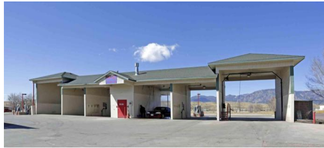
5150 Fontaine Blvd Fountain, CO 80817