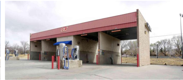
911 N Santa Fe Ave Fountain, CO 80817