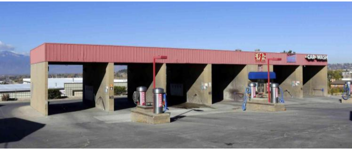
6665 Galley Rd Colorado Springs, CO 80915