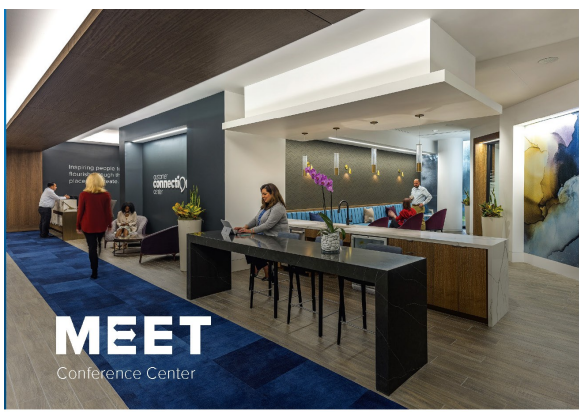
MEET Conference Center