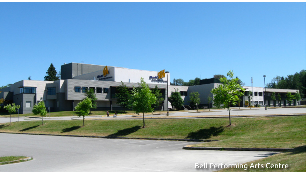
Bell Performing Arts Centre