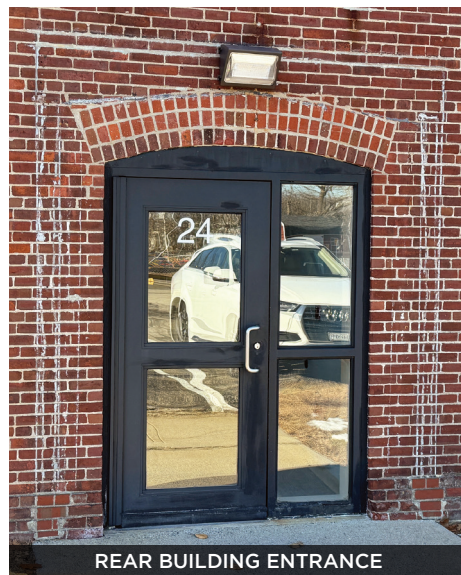
REAR BUILDING ENTRANCE