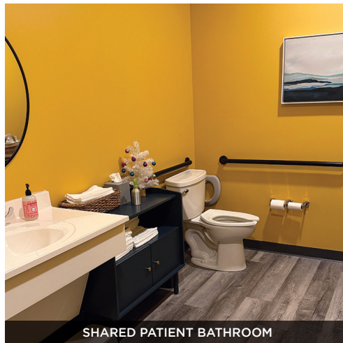
SHARED PATIENT BATHROOM