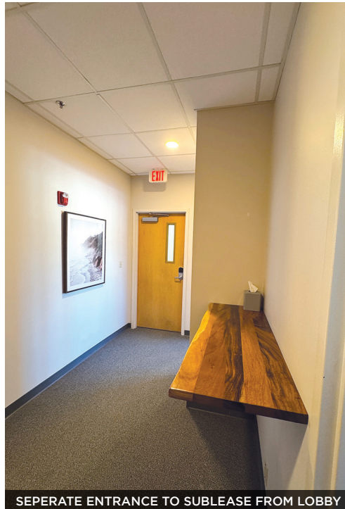
SEPERATE ENTRANCE TO SUBLEASE FROM LOBBY