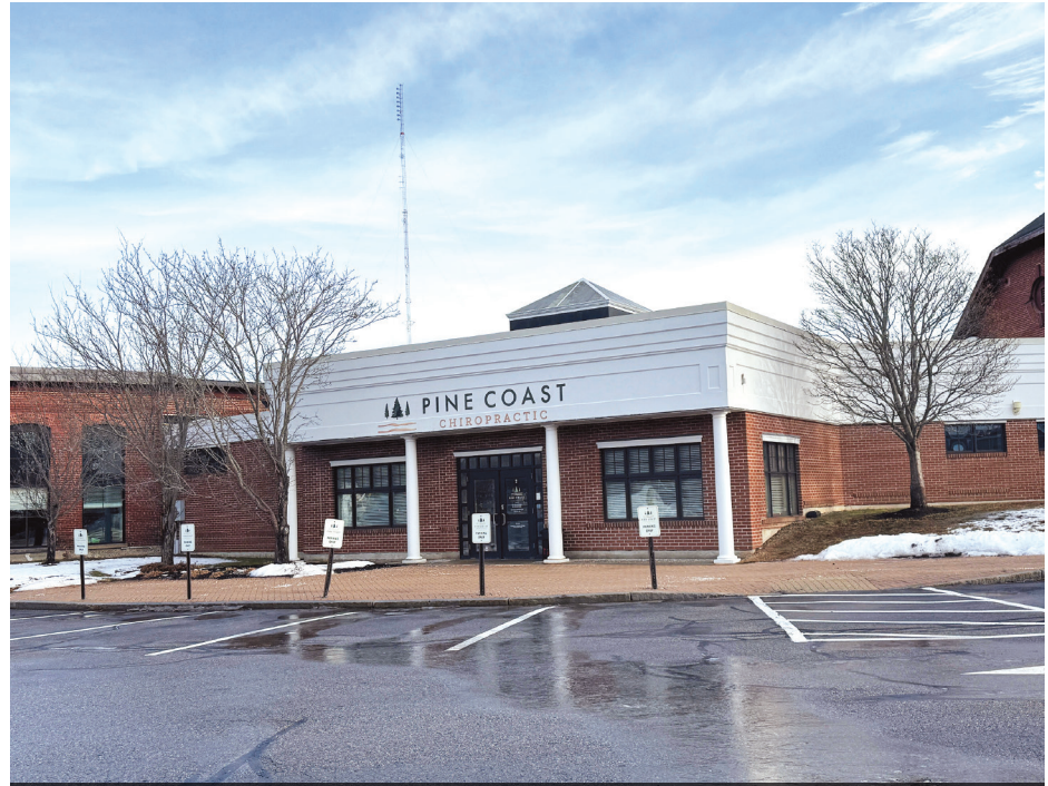
PINE COAST PARKING AND SHARED ENTRANCE TO SUBLEASE SPACE