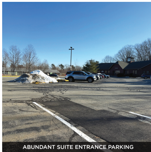
ABUNDANT SUITE ENTRANCE PARKING