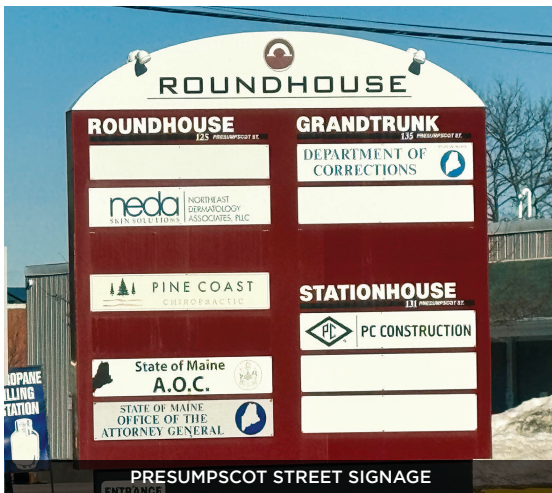
PRESUMPSCOT STREET SIGNAGE