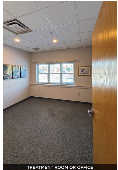
TREATMENT ROOM OR OFFICE