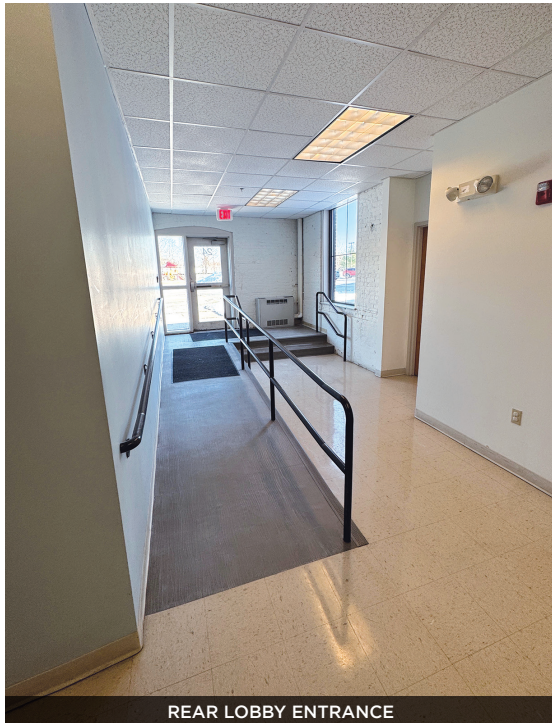
REAR LOBBY ENTRANCE