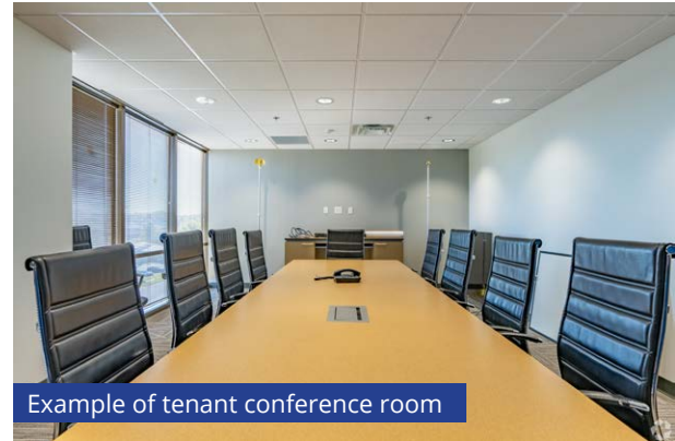
Example of tenant conference room