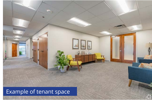
Example of tenant space