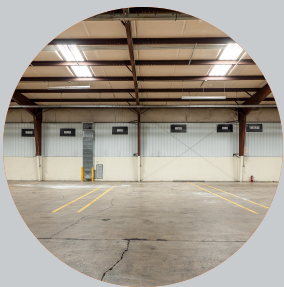
ORGANIZED WAREHOUSE LAYOUT