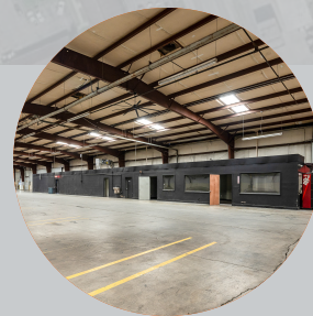
INTEGRATED OFFICE SUITES