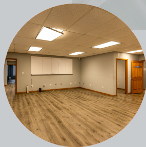
VERSATILE WORKSPACE AREA