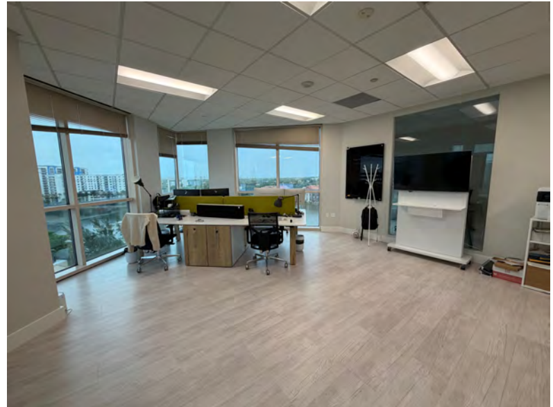
OPEN OFFICE LAYOUT