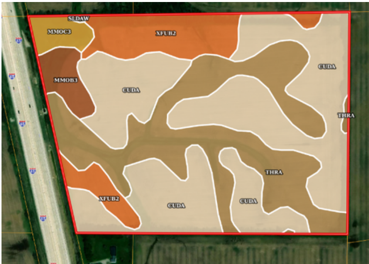
Boundary 57.2 ac