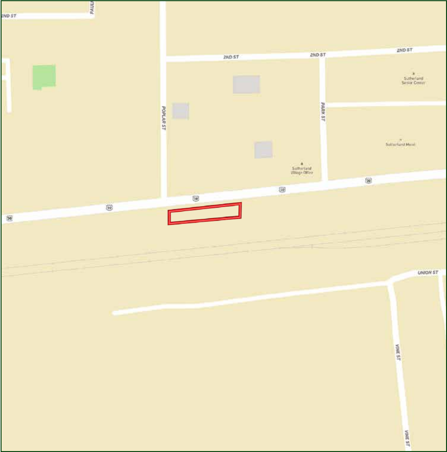
Boundary lines are estimates - Map for illustration only