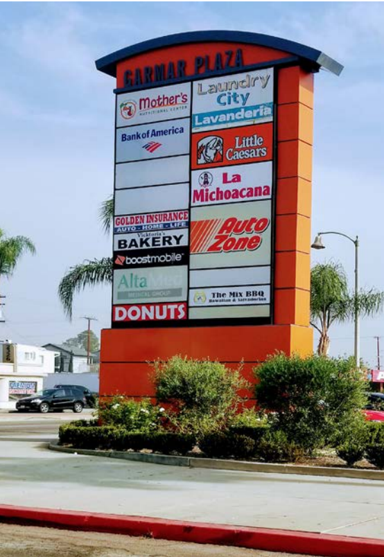
Pylon Signage Availability

UNIT 2313: LEASED 1,732 Sq. Ft. Large Open Space with Separate Office & One Restroom.