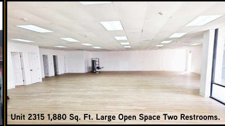
Unit 2315 1,880 Sq. Ft. Large Open Space Two Restrooms.