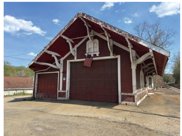
Vintage rail station with authentic small-town character