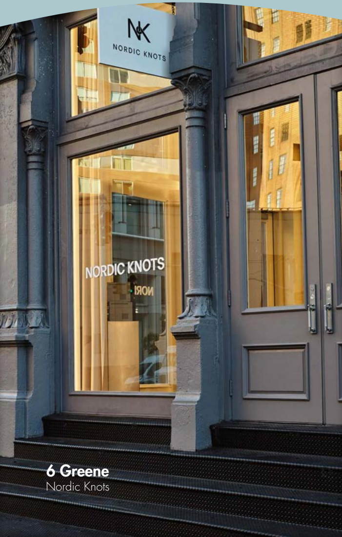
6 Greene Nordic Knots