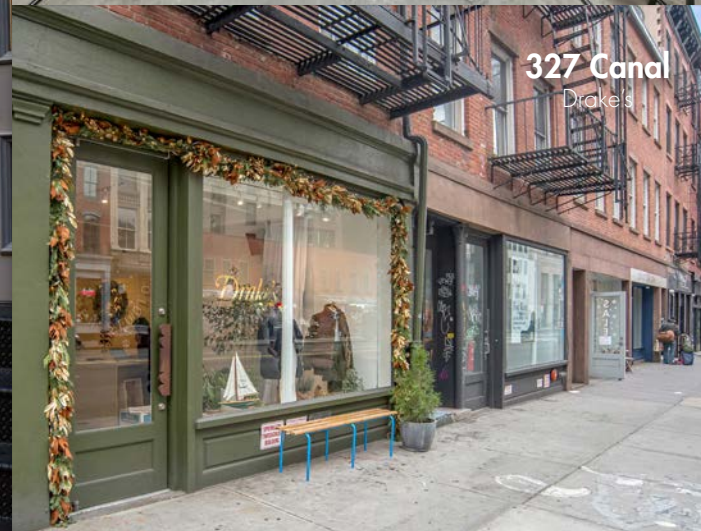
327 Canal Drakes