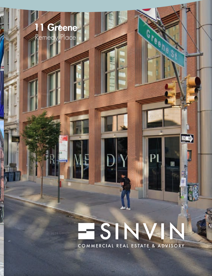
11 Greene Remedy Place