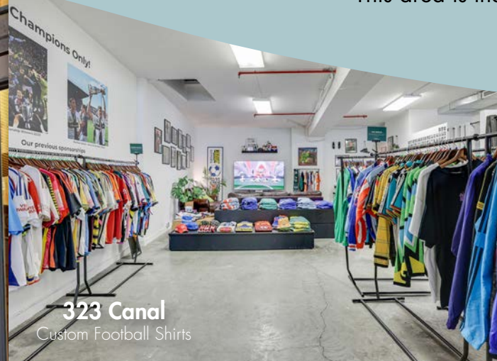
323 Canal Custom Football Shirts