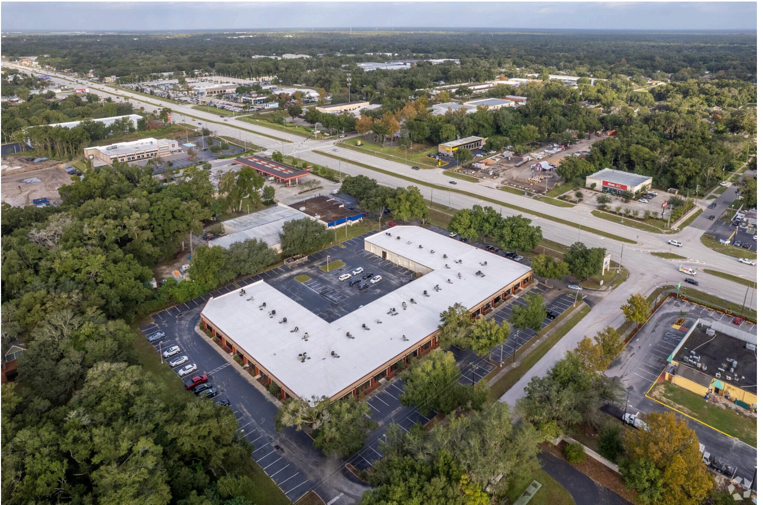
The Wekiva Executive Center has high visibility, facing onto Semoran Boulevard (SR-436), a major thoroughfare in the Orlando area, in the heart of a region that is exploding with growth.