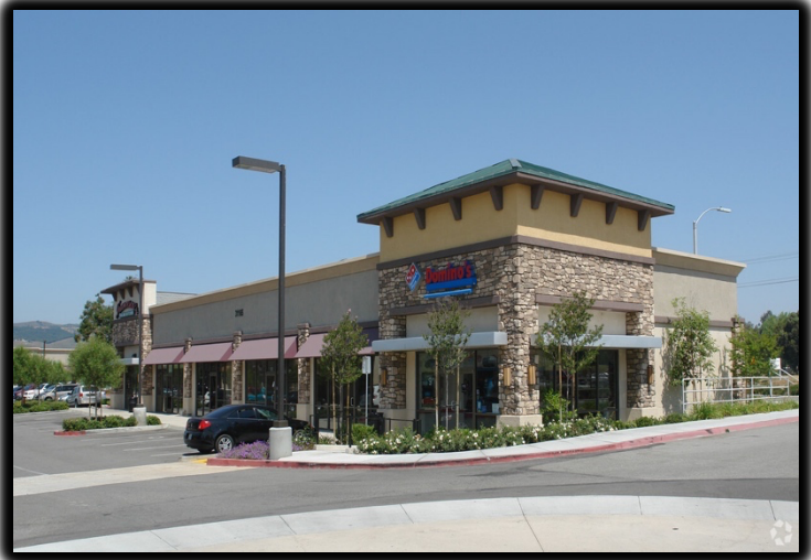
on this page.