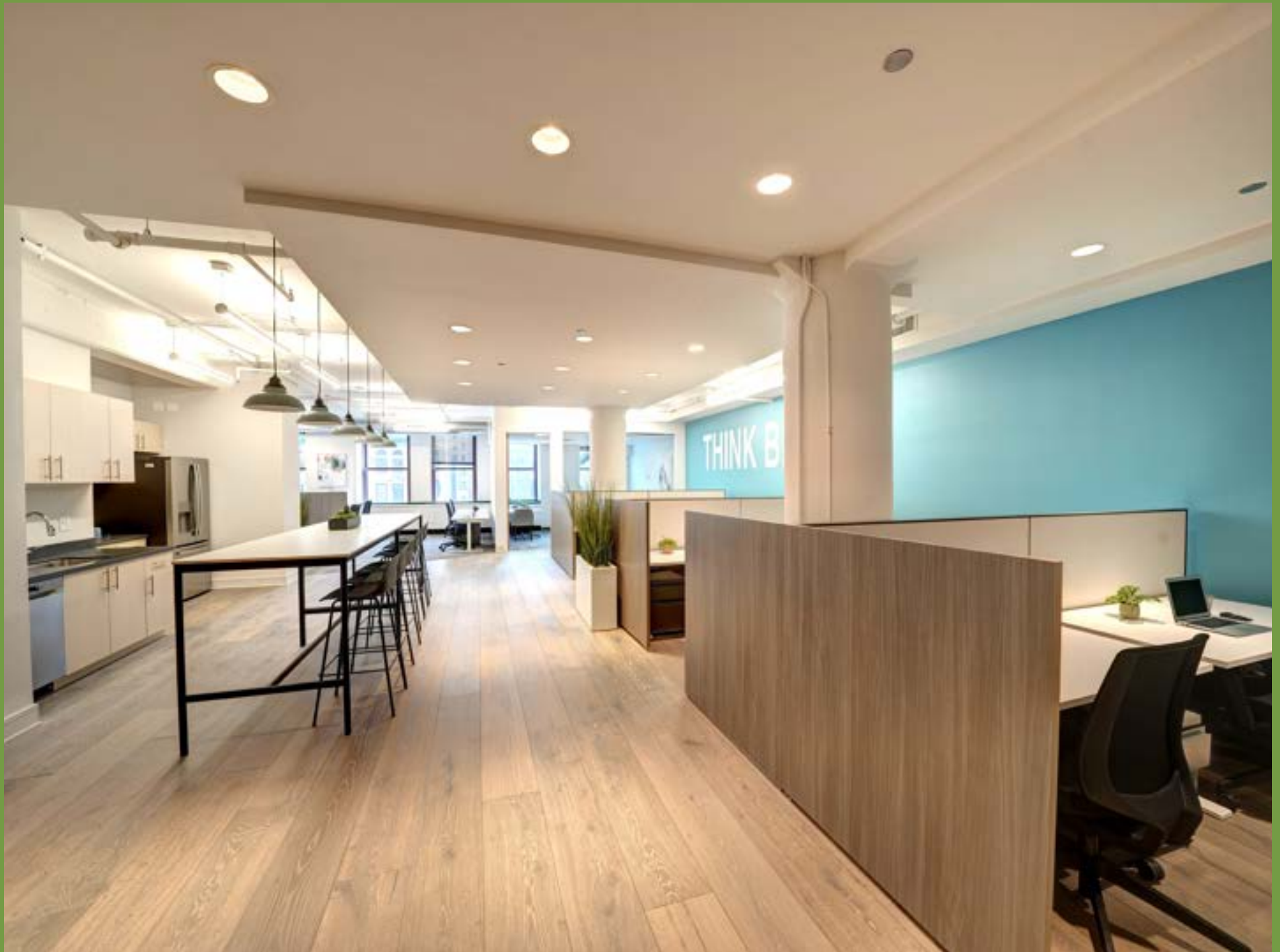
Photos taken from a similar space in the building