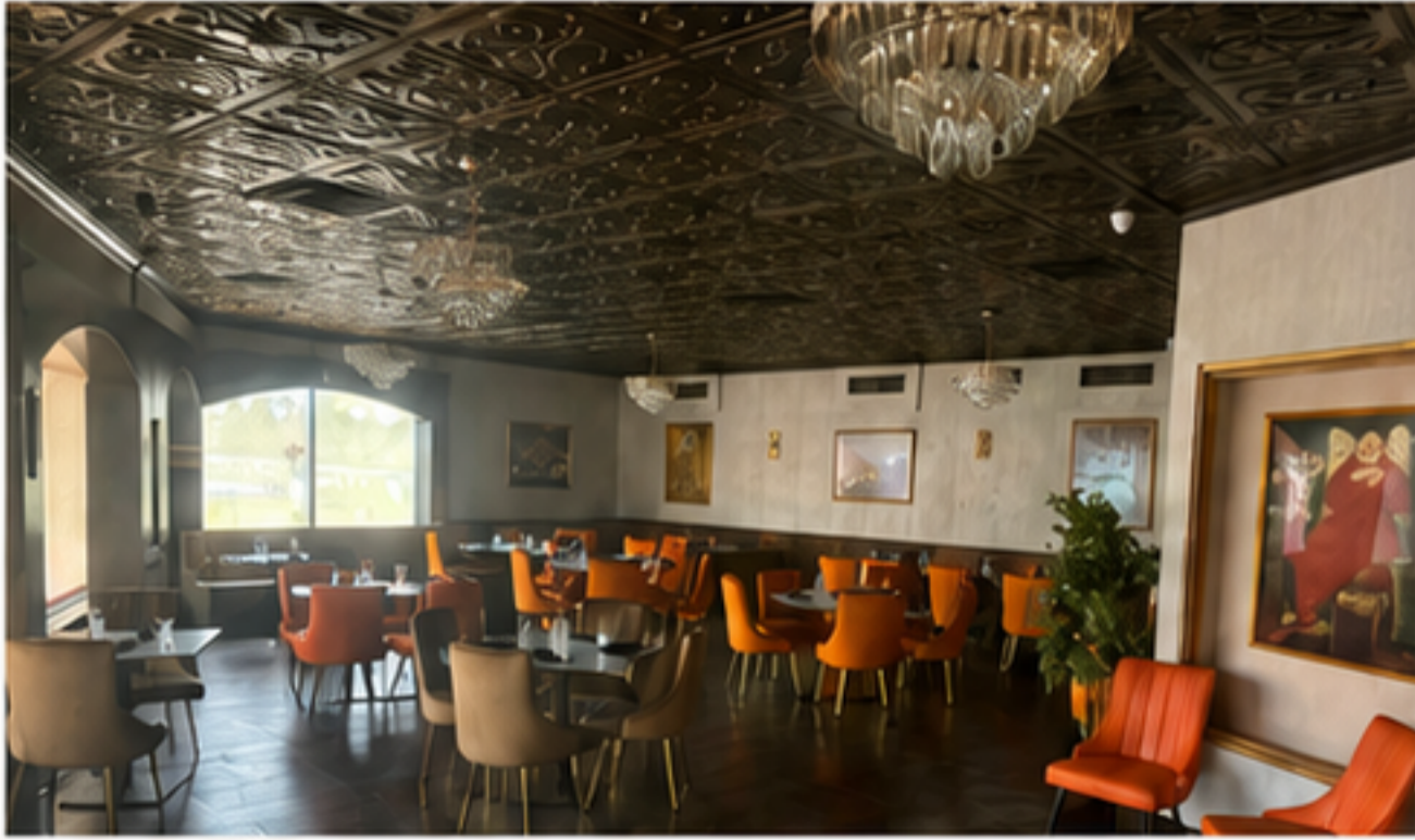
Dining room / frontage side