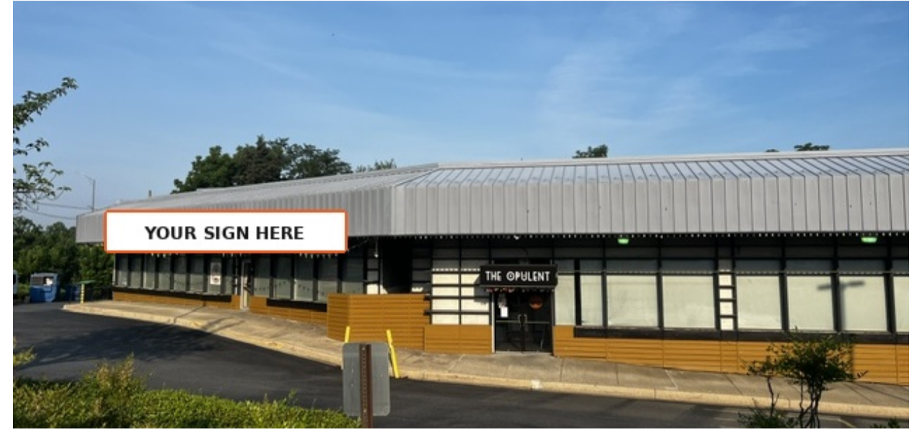
Frontage / signage opportunity

Concept shown for marketing only; approvals to be verified.