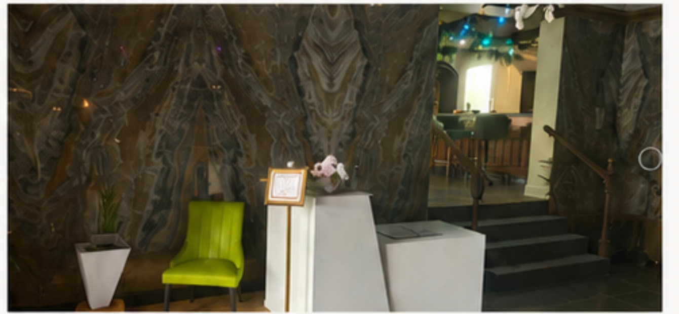
Entry / host stand