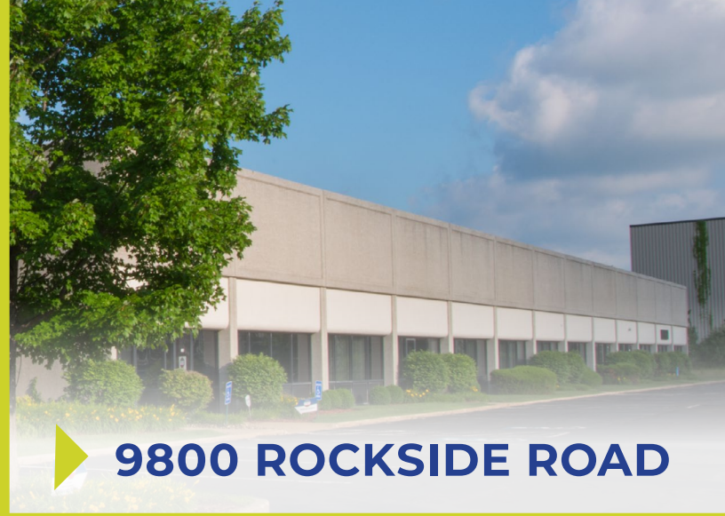
9800 ROCKSIDE ROAD