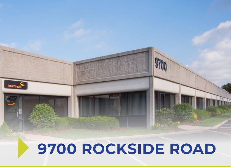
9700 ROCKSIDE ROAD