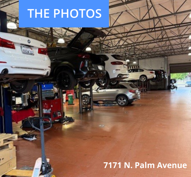
7171 N. Palm Avenue