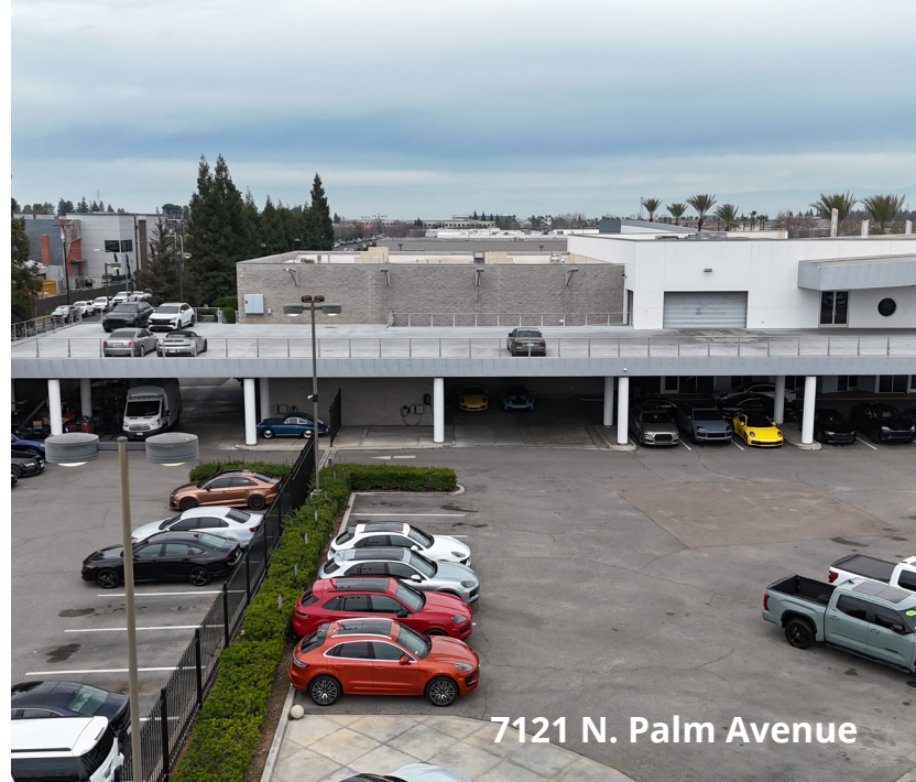
7121 N. Palm Avenue