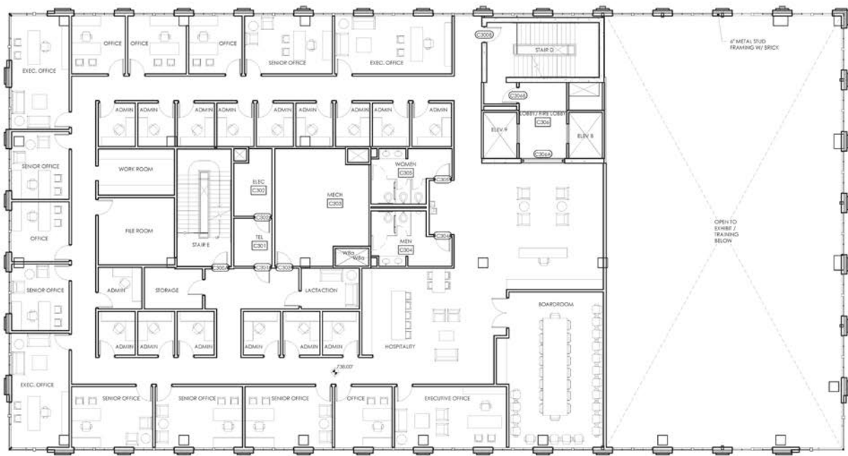
2 LEVEL 3/P3 ENLARGED PLAN A SCALE: 1/8" = 1'-0"