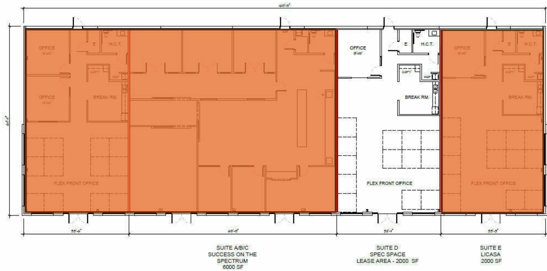
2901 MAUREL DRIVE - LEASE SPACE PLAN