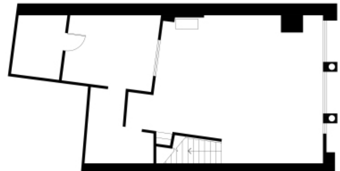
1ST FLOOR MEZZANINE