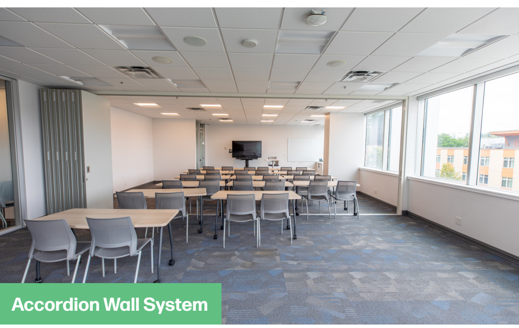
Accordion Wall System