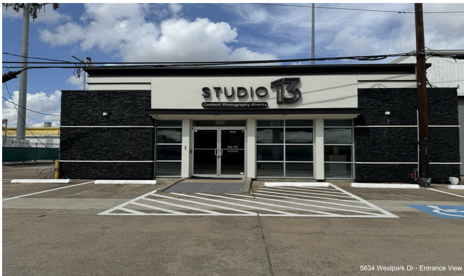
5634 Westpark Dr - Entrance View