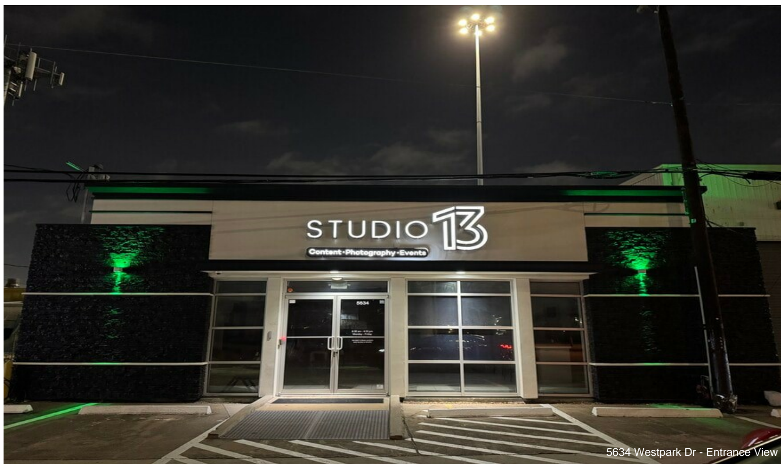
5634 Westpark Dr - Entrance View